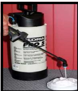
VOLKAFOAM FOAM SPRAYERS SUITABLE